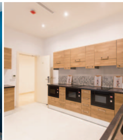
Easy School shared self-catering apartments.