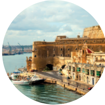
Valletta Grand Harbour