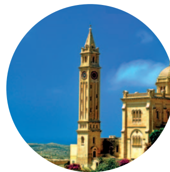
Ta' Pinn Church