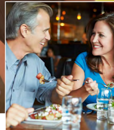
Max 4, Max 1, English and Golf, Discover Devon and Language Holidays for Adults all include networking lunches

Achieve your life goals with English Progress to the next English language level Take an exam preparation course to gain a qualification