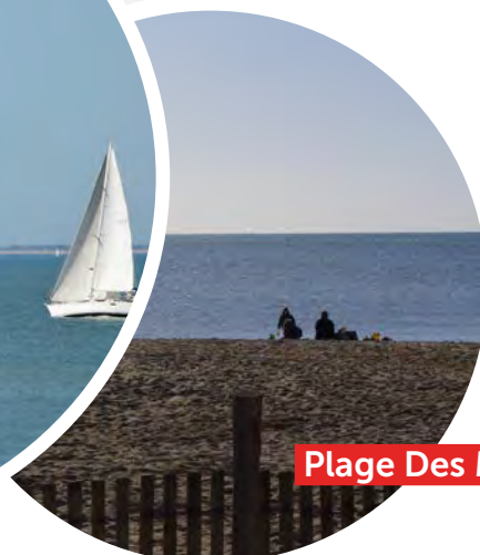
Plage Des Minimés