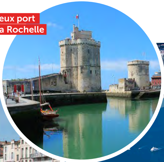
Vieux port de La Rochelle