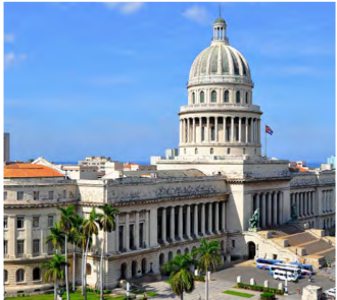
LA HABANA CUBA