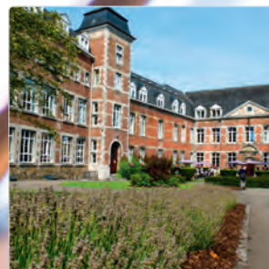
CERAN JUNIORS BELGIUM | Ferrières Residential training