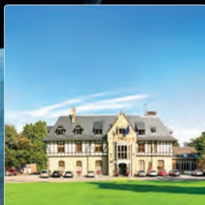
CERAN BELGIUM | Spa Residential training