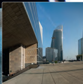
CERAN CITY | Paris Non-residential training