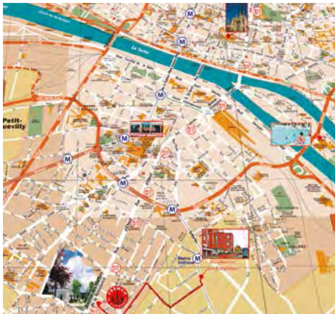
City Map showing FIN

Because we don't just say we care, we really do!