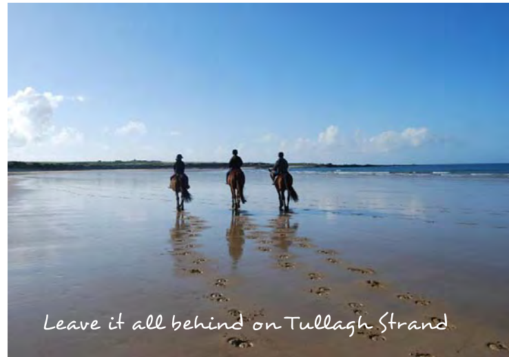
Leave it all behind on Tullagh Strand

On free weekends you can join a Saturday excursion and see some of Ireland's best tourist hot spots. Talk to our social team about free-time activities.