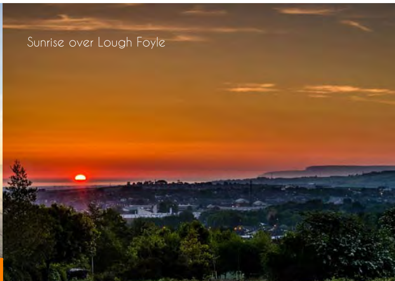
Sunrise over Lough Foyle