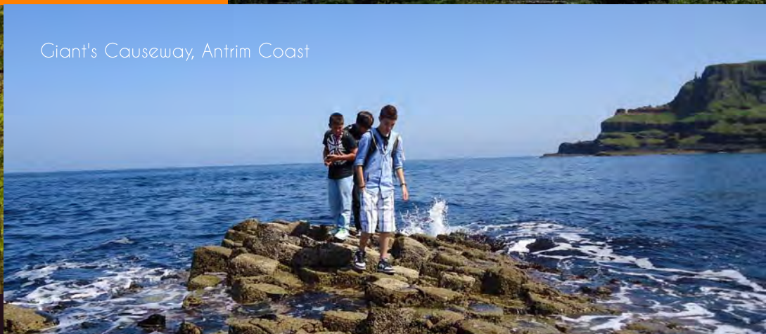
Giant's Causeway, Antrim Coast