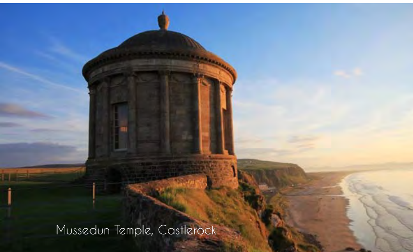
Mussedun Temple, Castlerock