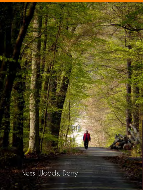
Ness Woods, Derry