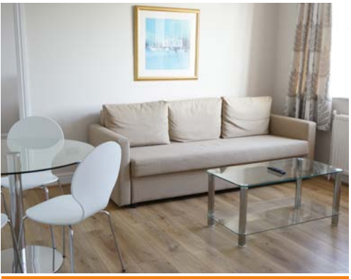
2 Chelsea Cloisters ****