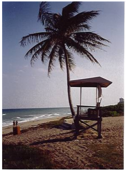
Our Boca Raton campus is walking distance to the beach