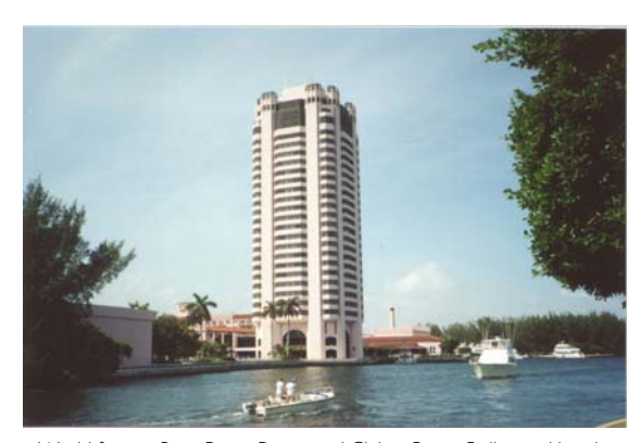
World famous Boca Raton Resort and Club, a 5-star, 5-diamond hotel