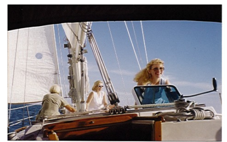
A wealth of activities