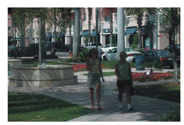
Lively Mizner Park, with its wonderful shops and cafes, is located just five minutes from our campus and is a very popular destination for our students