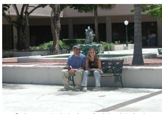
Students can enjoy the lovely tree-lined plaza during breaks.

Located only approximately one half hour away from Fort Lauderdale, this outstanding location offers the best of both worlds to its students -- the security of a small town and the proximity to famous big cities. Our students have easy access to famous Fort Lauderdale, known as 'the Venice of America,' as well as to Palm Beach and Miami, and regular enjoyable excursions are planned each week to these fun locations.