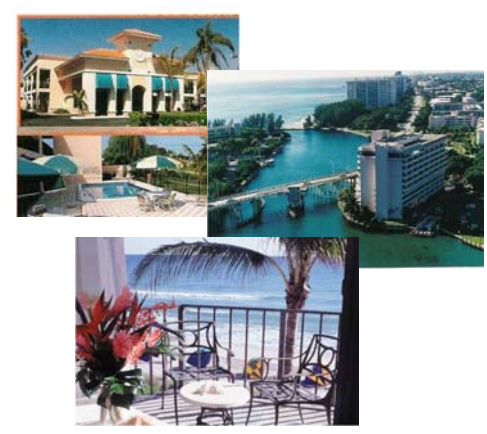
Hotels are either in town or on the ocean

Transfers are available to and from Palm Beach, Fort Lauderdale and Miami International Airports.