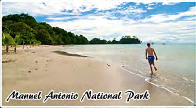
Manuel Antonio National Park