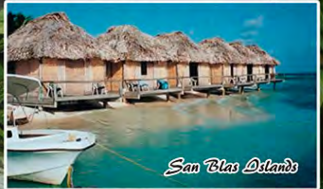
San Blas Islands