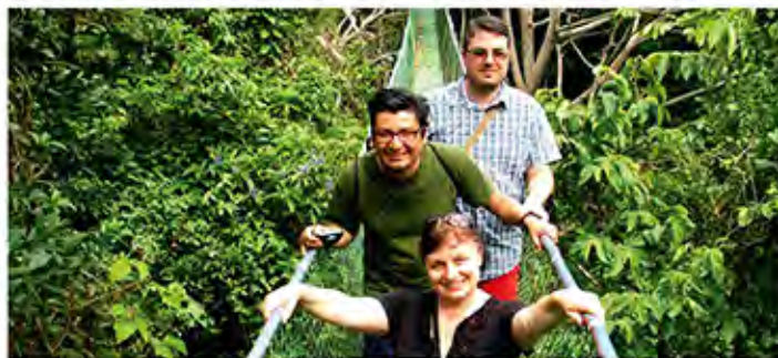
Program directors from Butler University and Valdosta State University

Studying abroad is a wonderful experience from a personal and professional point of view. It's a way to excel beyond hundreds of professionals that graduate every year and the perfect opportunity to learn a new language. That being said, we encourage faculty members all over the world to participate in these priceless programs. Besides the language portion, there are several advantages that can be mentioned for studying abroad that you, as a teacher, don't want your students to miss: