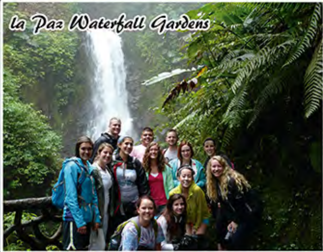
La Paz Waterfall Gardens