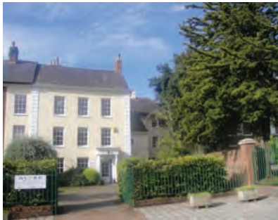
The Globe Reception