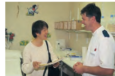
Medical student meeting a hospital colleague

We organise meetings, visits or placements in organisations working in the same professional field as you. We can put you in contact with local companies for possible business links. You should apply for such visits when booking your course.