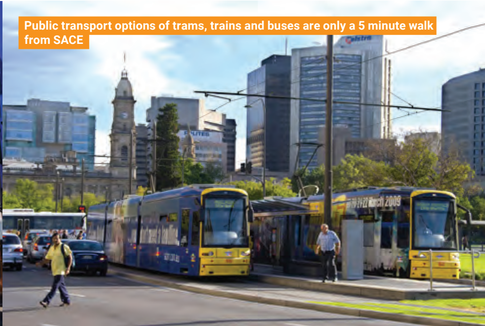
Public transport options of trams, trains and buses are only a 5 minute walk from SACE