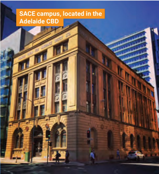
SACE campus, located in the Adelaide CBD