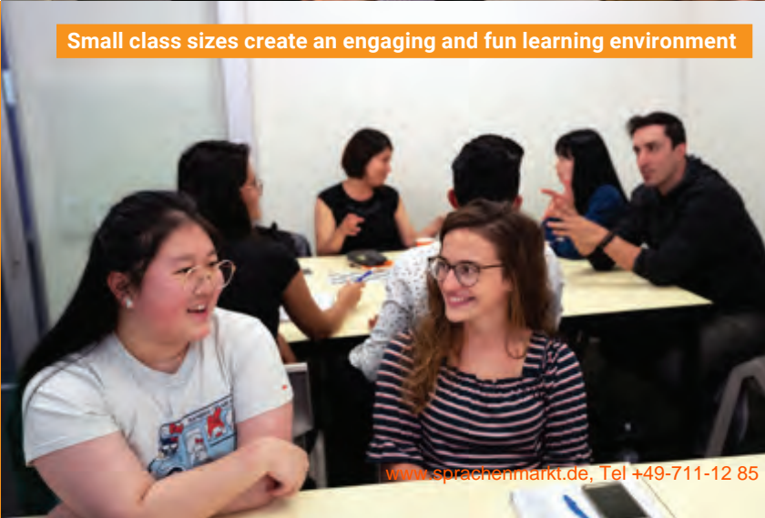
Small class sizes create an engaging and fun learning environment