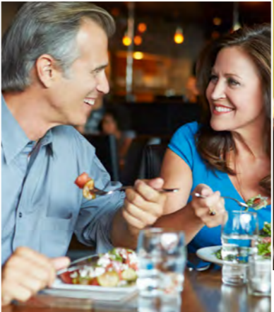
Max 4, Max 1, English and Golf, and Discover Devon all include networking lunches Monday to Thursday

Achieve your life goals with English Progress to the next English language level Take an exam preparation course to gain a qualification