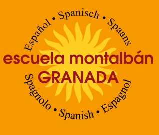
Escuela Montalbán C/ Conde Cifuentes, nº 11 18005 Granada, Spain

Last minute details about courses, prices, accommodation and special programmes are available online. Please contact us for further information.