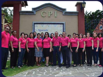
CPI Monteverde Staff