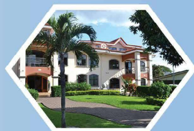
Heredia Typical Town