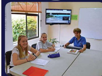
Students in class