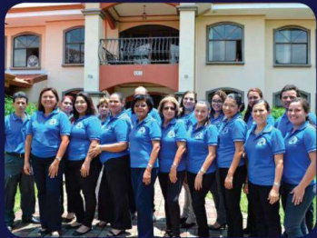
CPI Heredia Staff