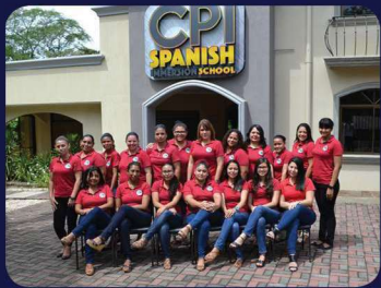
CPI Flamingo Staff