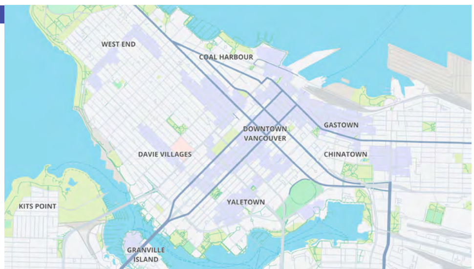
Vancouver Downtown Map

With a mild climate, stunning views at every turn, and a diverse mix of cultures, Vancouver is a year-round destination . The city is a haven for nature lovers and city explorers alike, offering everything from tranquil parks to world-class restaurants. Let's dive into the must-see sights and activities that make Vancouver one of the most sought-after destinations in the world.