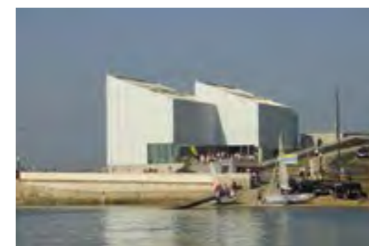
The Turner Contemporary Art Gallery