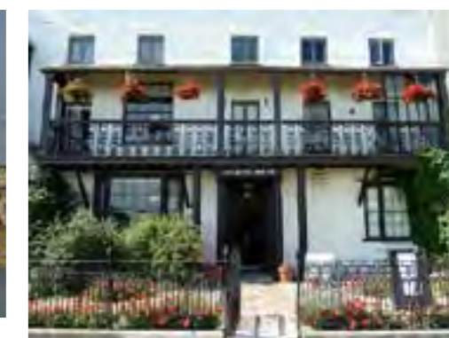
Dickens House Museum