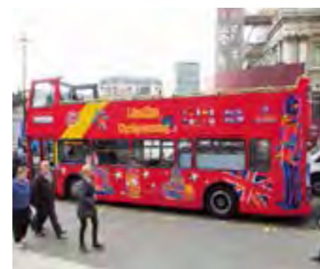
London hop on hop off bus