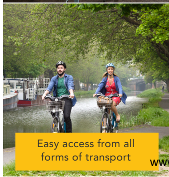
Easy access from all forms of transport