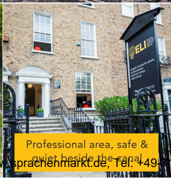
Professional area, safe & quiet beside the canal