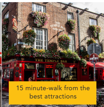
15 minute-walk from the best attractions