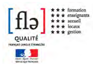
Quality Label FLE

French as a Foreign Language, is granted by the French Minister of Education and Culture.