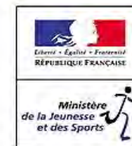
Ministry of Youth and French Sports

European quality label with extremely stringent standard requiring inspection of teaching, accommodation, reception, student follow-up and full compliance with regulations.