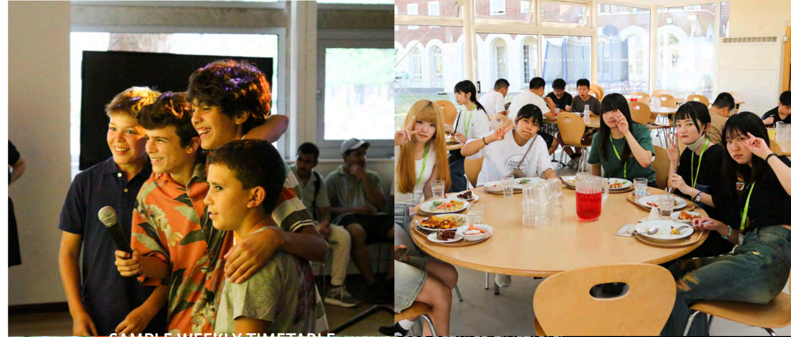
SAMPLE WEEKLY TIMETABLE (INQUIRE FOR DETAILED TIMETABLE)

The summer school will use many of the available facilities provided by Cheltenham Ladies' College.